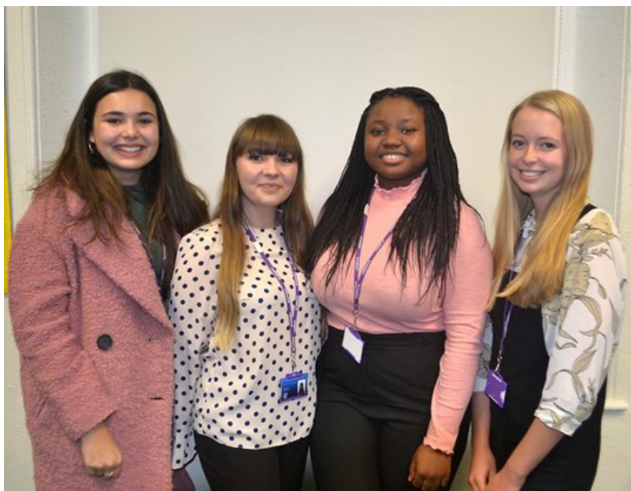
Our Head Girl Team