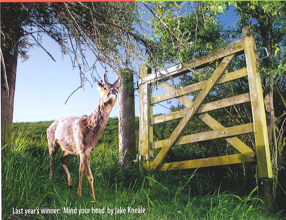
Last year's winner: 'Mind your head' by Jake Kneale